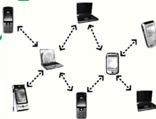
Fig. 1 An Example of Mobile Ad hoc Network (MANET)

A Mobile Ad Hoc Network (MANET) is built on the fly where a number of mobile nodes work in cooperation without the engagement of any centralized access point or any fixed infrastructure. MANETs are self-organizing, self-configuring, and dynamic topology networks, which form a particular class of multi-hop networks. Minimal configuration, absence of infrastructure, and quick deployment make them convenient for combat, medical, and other emergency situations. A sample model of mobile ad hoc network is presented here in Fig. 1,